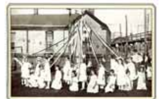
Remember the May pole dance...