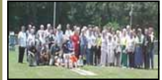
Group photo from the 2001 Fogleman Reunion